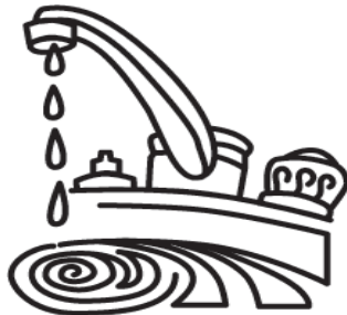
Graphic from Ohio State University Extension