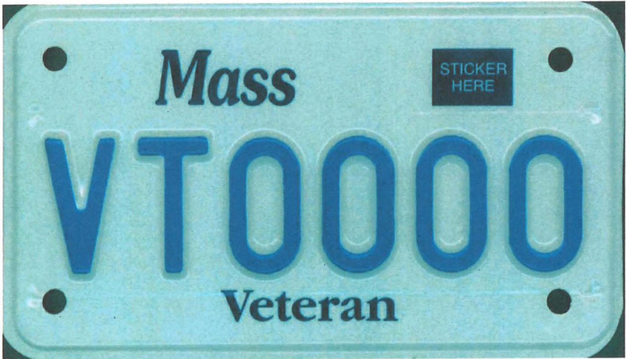
veteran motorcycle plate