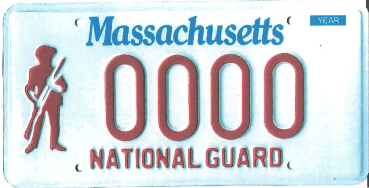
national guard plate