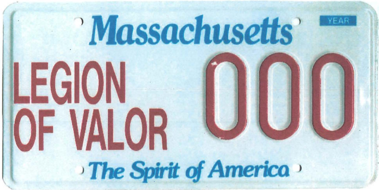
legion of valor plate