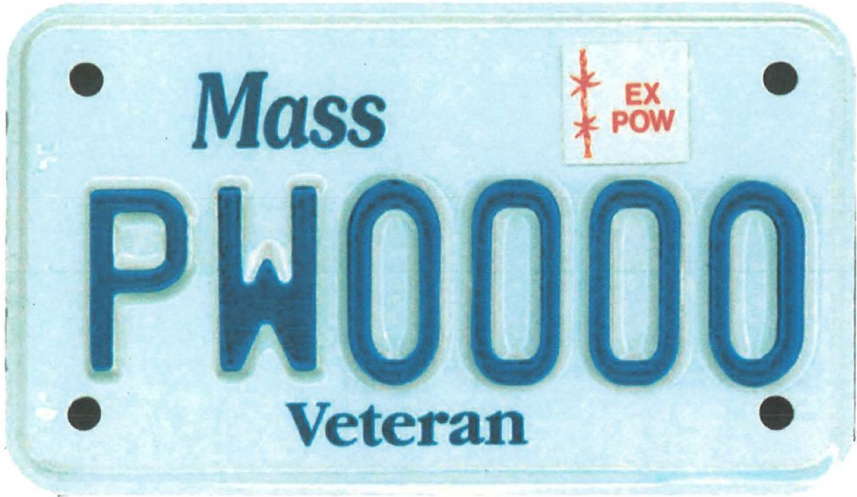
ex-prisoner of war motorcycle plate