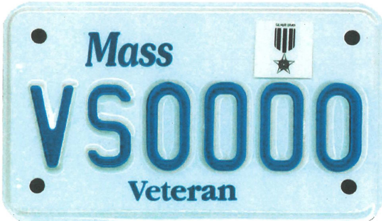
silver star motorcycle plate