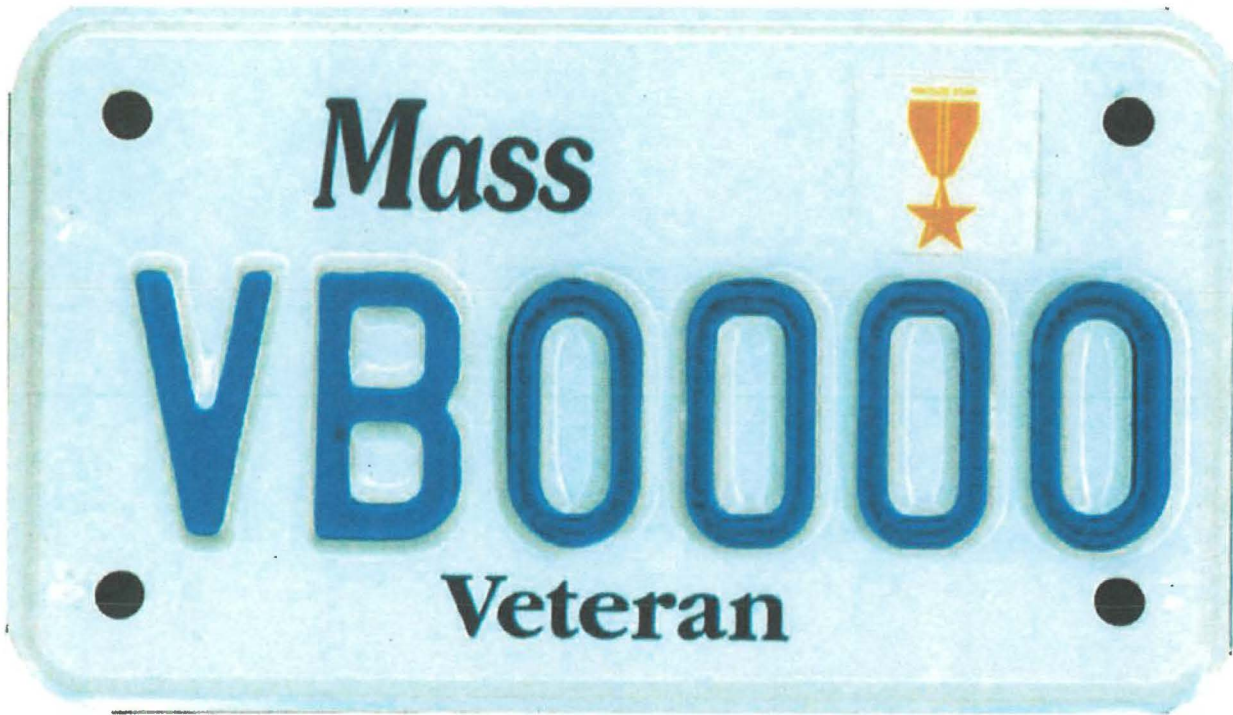
bronze star motorcycle plate