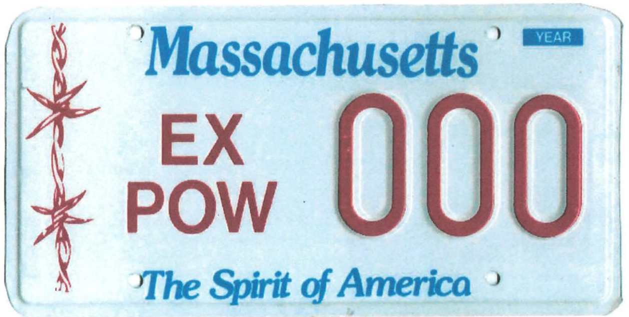
ex pow plate