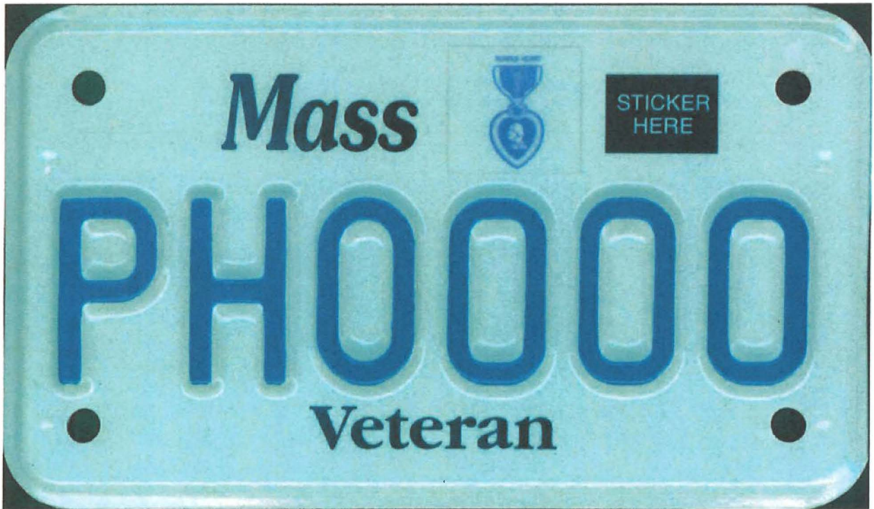
purple heart motorcycle plate