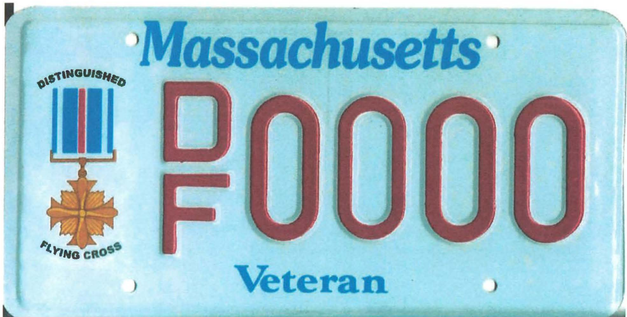
distinguished flying cross plate