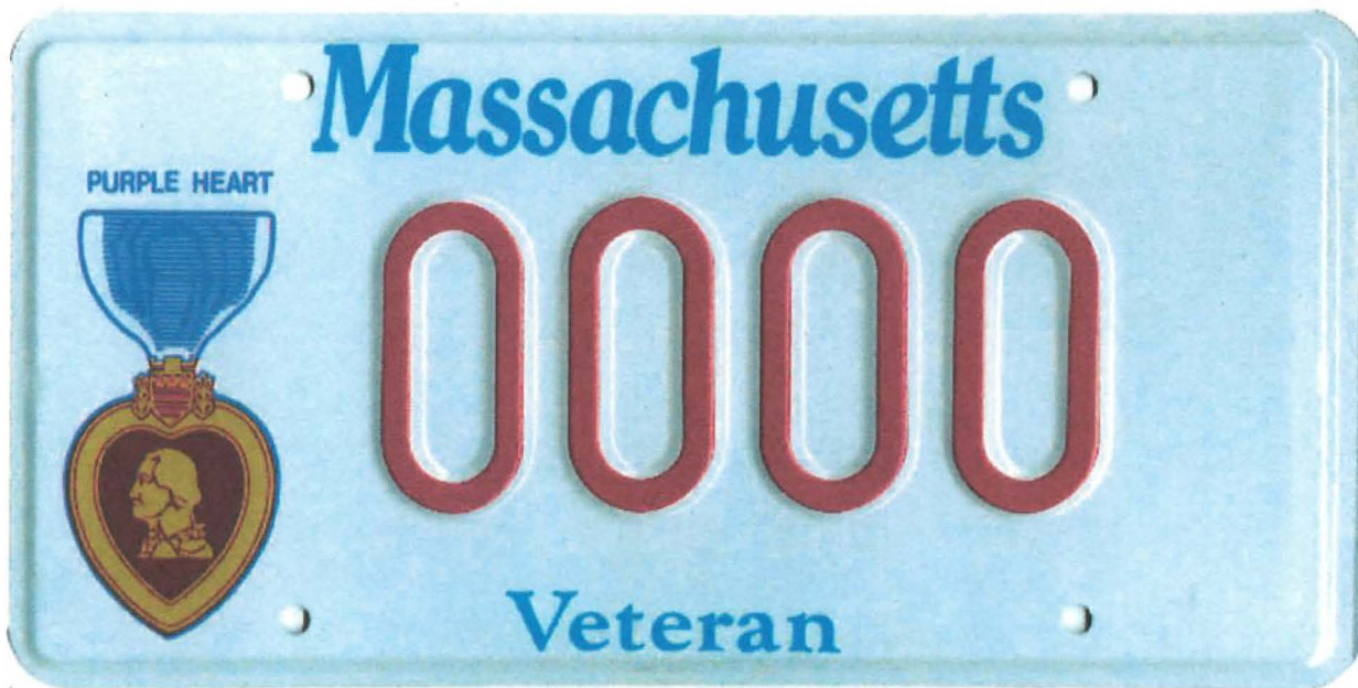
purple heart plate