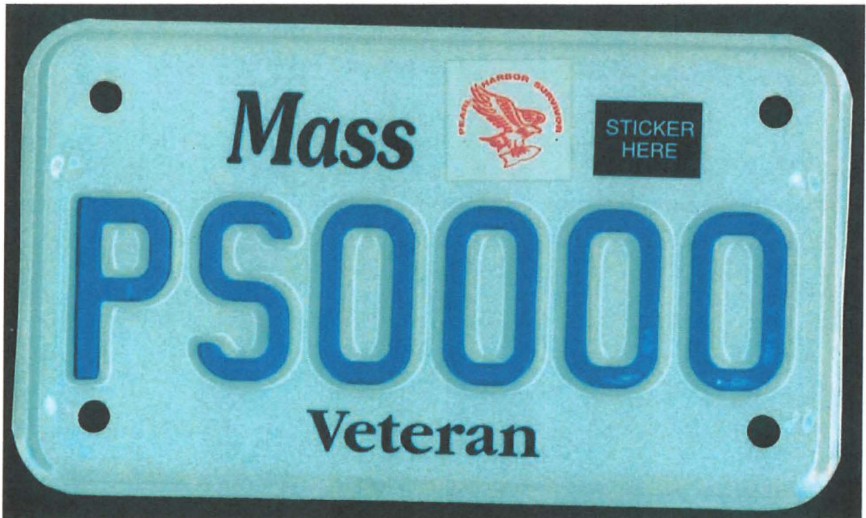
pearl harbor survivor motorcycle plate