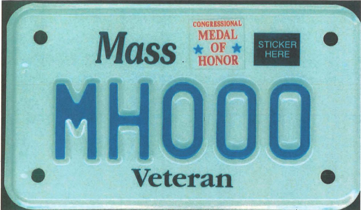
congressional medal of honor motorcycle plate