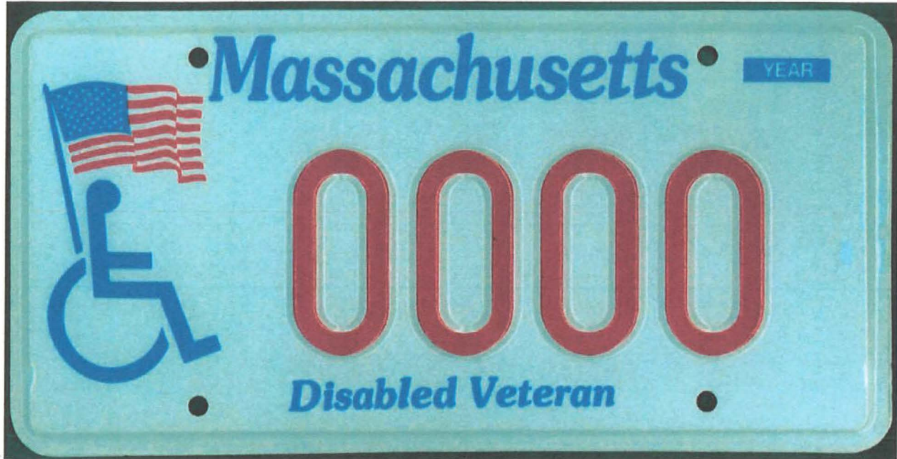
disabled veteran plate