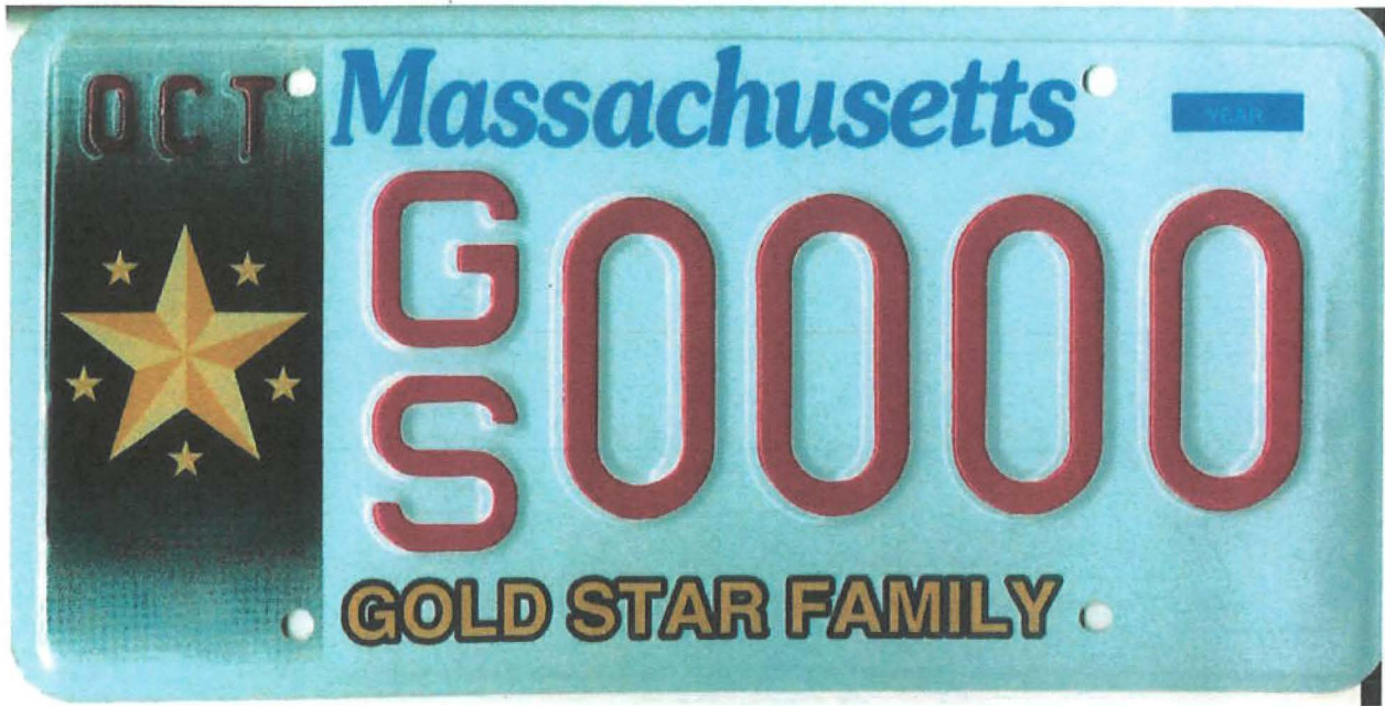
gold star family plate