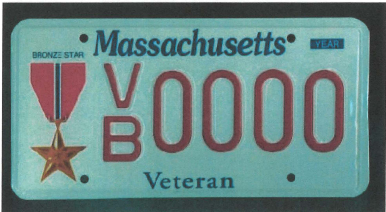
bronze star plate