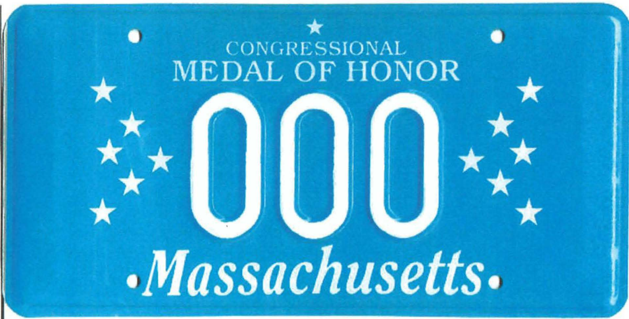
medal of honor plate