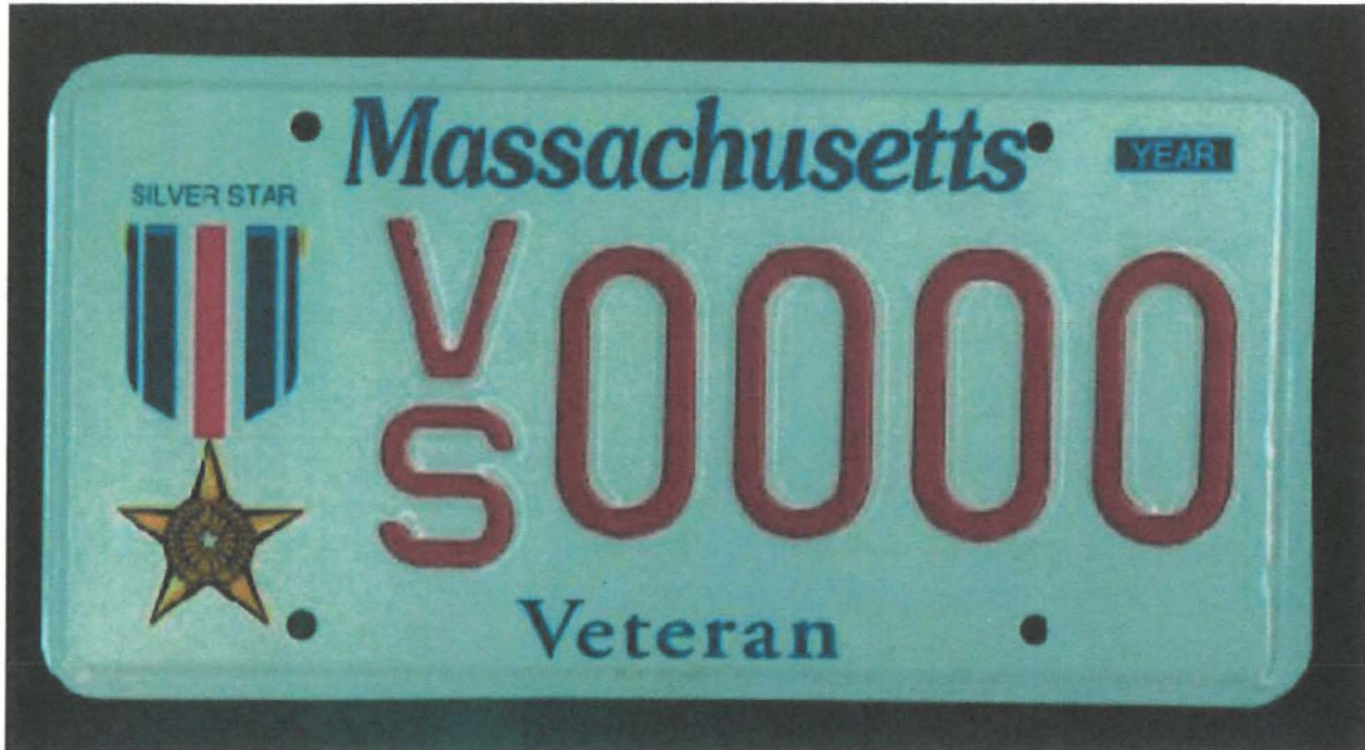
silver star plate