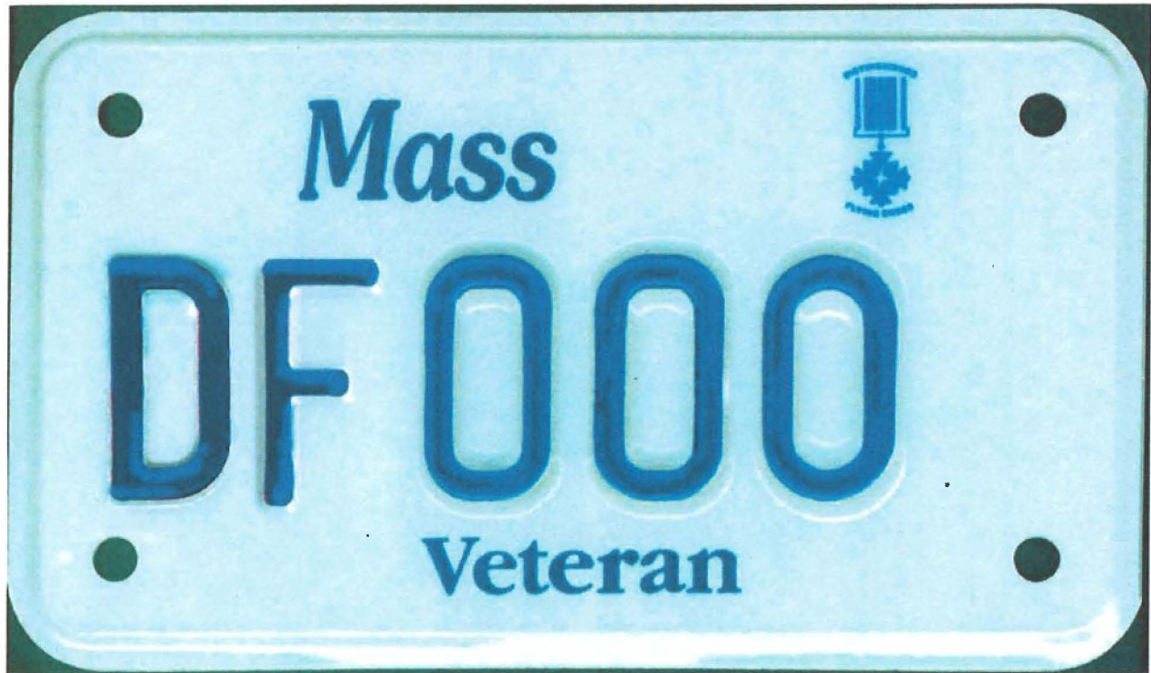
distinguished flying cross motorcycle plate