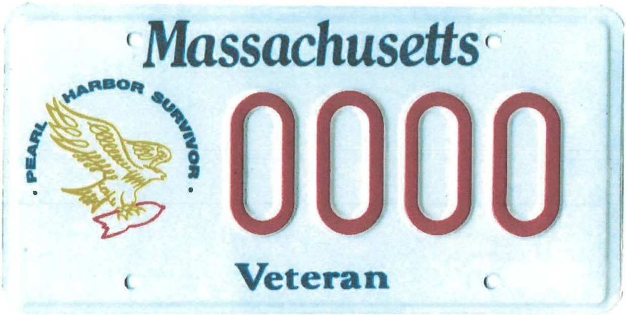
pearl harbor survivor plate